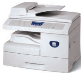
WorkCentre M15 with Automatic Document Feeder

A new class of copier-printers from Xerox, they offer network printing, optional fax and optional e-mail that's incredibly reliable and easy to use. Plus, color-enabled DocuColor® models let you copy, print and scan color documents when you need them. They're a great investment for budget-minded businesses that want to consolidate assets, reduce costs and improve workflow.