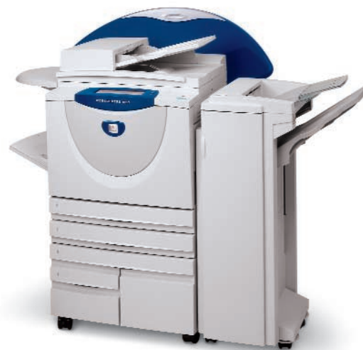
WorkCentre M55 with Office Finisher