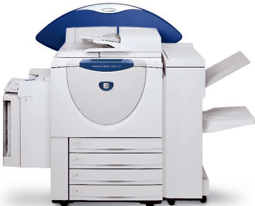
WorkCentre Pro 65 with 3,100-Sheet High-Capacity Feeder and Office Finisher